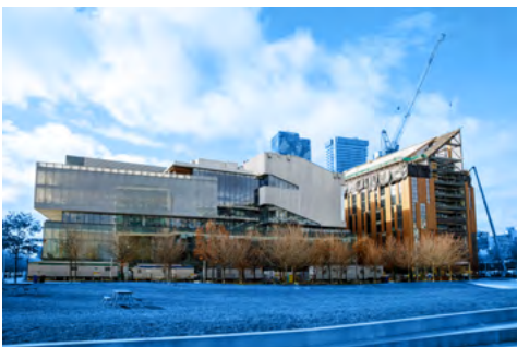
51 Dockside & Limberlost Place