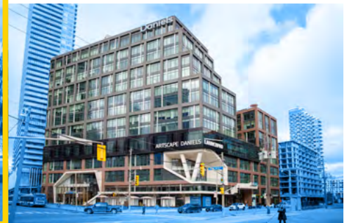
3 Lower Jarvis