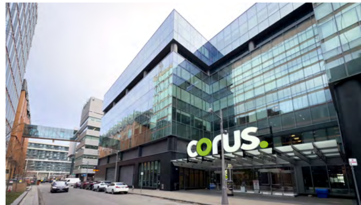
25 Dockside Drive