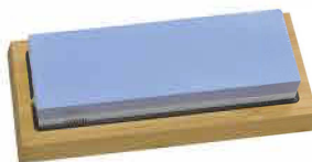
SHARPENING STONE SET 400/1000 GRIT