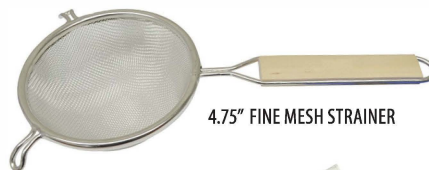
4.75" FINE MESH STRAINER