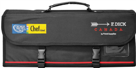
17 PIECE CAPACITY KNIFE ROLL BAG

Below is the entire listing of individual knives and other small wares items that are included in the George Brown College complete culinary kit.