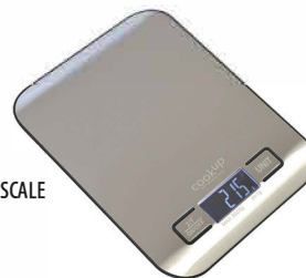
DIGITAL KITCHEN SCALE