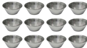
STAINLESS STEEL RAMEKIN/ SAUCE CUP 4OZ 12/PACK