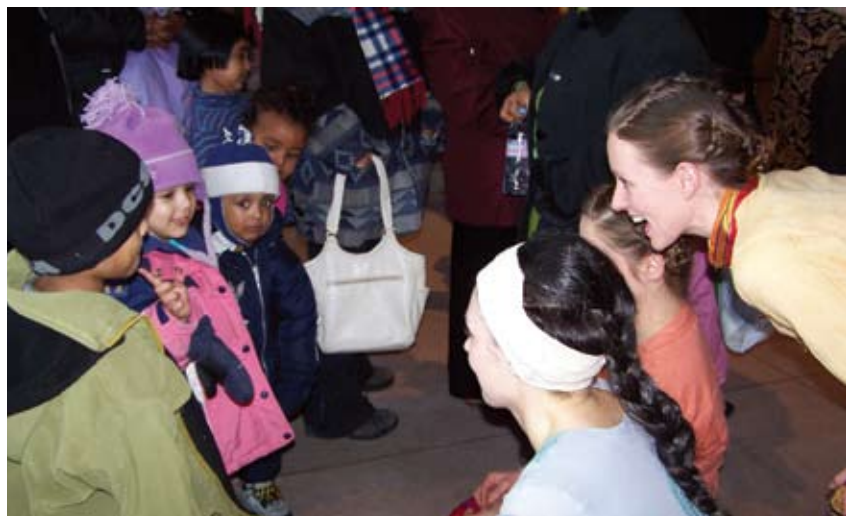
Tales of the Arabian Nights' cast members welcome students from Nelson Mandela Park Public School to the Young Centre.

In December hundreds of Metro school children came to the Young Centre for George Brown's production of Tales from the Arabian Nights . As part of the College's 40th Anniversary celebration, students from Nelson Mandela Park Public School were treated to a complimentary performance of the show. Also in December, first year theatre students brought their music class into the Atrium and holiday songs from around the world echoed throughout the building.