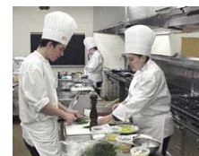
Pictures from Canadian Chefs Congress October 5, 2003

Central Tech School won in the Savoury Competition and Oshawa Central Collegiate Institute took the prize for Baking..